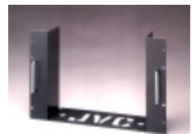
RK-A140E Optional Rack Mount Adapter