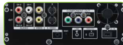
HVR-M15E Rear panel