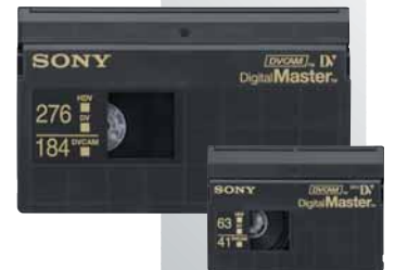
Dual-size Cassette Mechanism