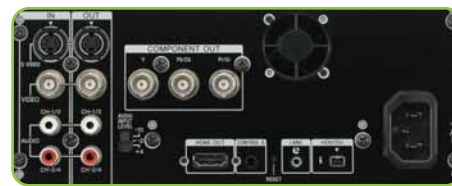
HVR-M25E Rear panel