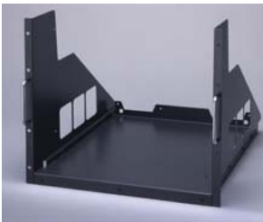
RK-C1900E ■ EIA Rack Mount Adapter