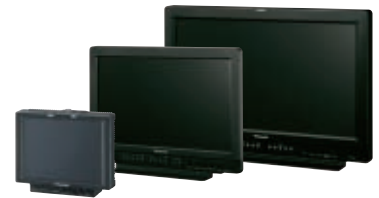
BT-LH900A 8.4" HD/SD LCD monitor BT-LH1700W 17" Wide HD/SD LCD monitor BT-LH2600W 26" Wide HD/SD LCD monitor