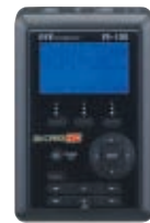
FireStore FS-100 Portable DTE Recorder (FOCUS Enhancements, Inc.)