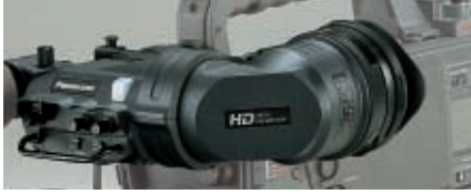
AJ-HVF21G 2" HD EVF 59.94Hz/50.00Hz switchable