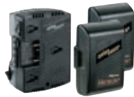
Anton/Bauer Battery Charger Package HTP-T230