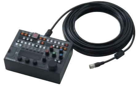
AJ-RC10G RCU (Remote Control Unit) • 10P Remote Cable 10m