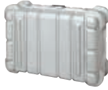
AJ-HT901G Hard Carrying Case *Not available in some areas.