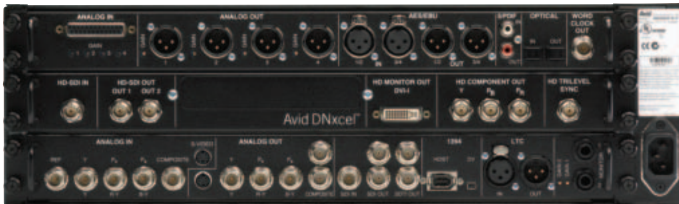
shown with optional Avid DNxcel board

Avid qualifies, tests, and supports Media Composer Adrenaline HD software and hardware on specific CPUs and storage subsystems to deliver the highest performance and customer satisfaction.