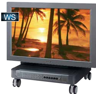
LMD-322W with SU-559