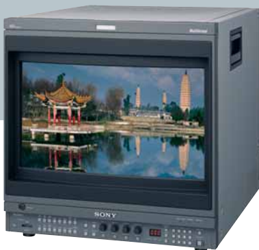
BKM-35H Control Unit attached to BVM-A20F1M