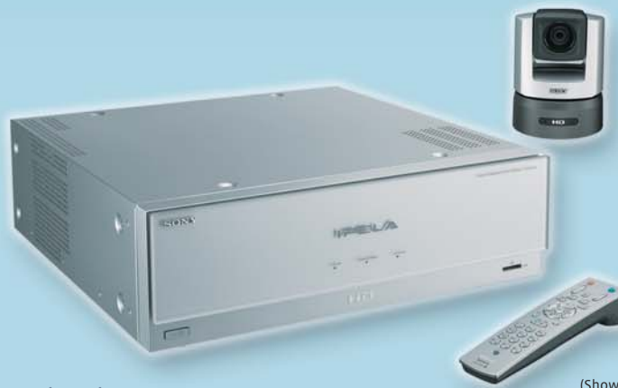
(Shown with optional PCSA-CHG90 camera unit)