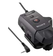
RM-1BP Remote controller