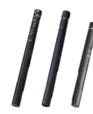
ECM-680S/678/673 Shotgun-type Electret Condenser Microphone