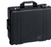
LCH-GT1BP Hard carrying case