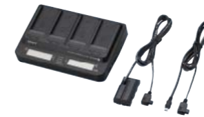
AC-VQL1BP AC Adaptor / Charger