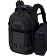
LCS-BP1BP Backpack style carrying case