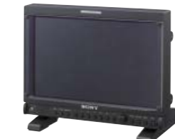
LMD-940W Professional LCD Monitor