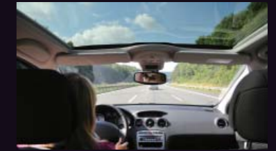
With Active SteadyShot