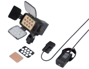
HVL-LBPA LED Battery Video Light