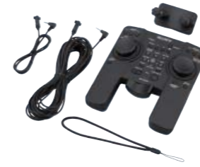
RM-1000BP Remote Commander