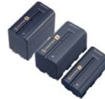
NP-F970/F770/F570 InfoLITHIUM Rechargeable Batteries