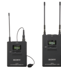
UWP-V1 UHF Wireless Microphone Package