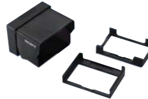
SH-L32WBP LCD Hood