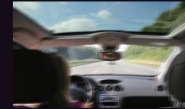
Without Active SteadyShot