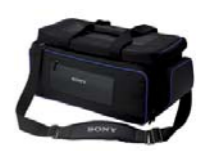
LCS-G1BP Soft carrying case