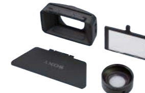
VCL-HG0872K 0.8x wide conversion lens with matte box