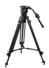
VCT-PG11RMB Tripod with RM-1BP Remote Controller