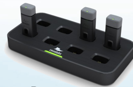
HD Charger Base