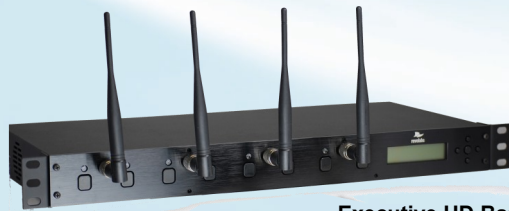
Executive HD Base Station