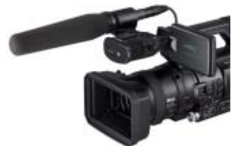
The ECM-678 attached to a Sony camcorder

The vibration-resistant mechanism of the ECM-678 offers high durability and reliability, making it suitable for the harshest environments encountered in the most demanding of sound-acquisition scenarios.